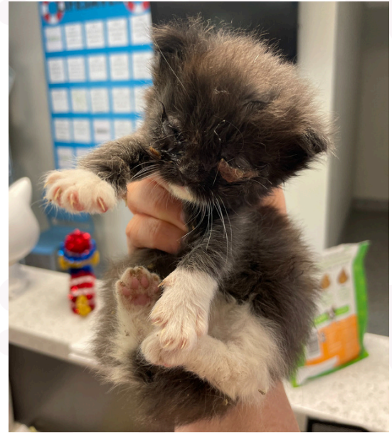
Mousey was found outside with a bad eye infection at just two weeks old.

You’re well on your way to saving some of the most vulnerable lives out there! When contacting shelters for assistance, let them know that you can foster until they have space. And make sure to get momma cat spayed so that this cycle won’t rinse and repeat (cats have 2-3 litters every year, after all!). None of us can do it all on our own; but with a little help, we can do a whole lot, together.