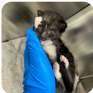
The 5 ‘W’ kittens were found with their mom, who had died.