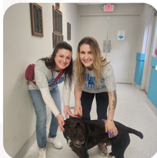
TQL teams have been volunteering at the League for years, putting their compassion into action!