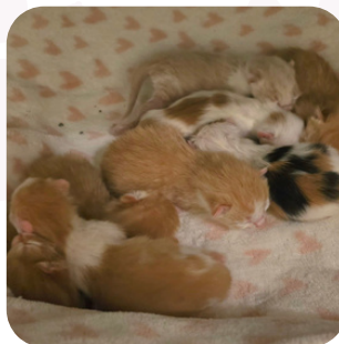
Creamsicle is a tame stray cat, so we were able to keep her kittens with her!